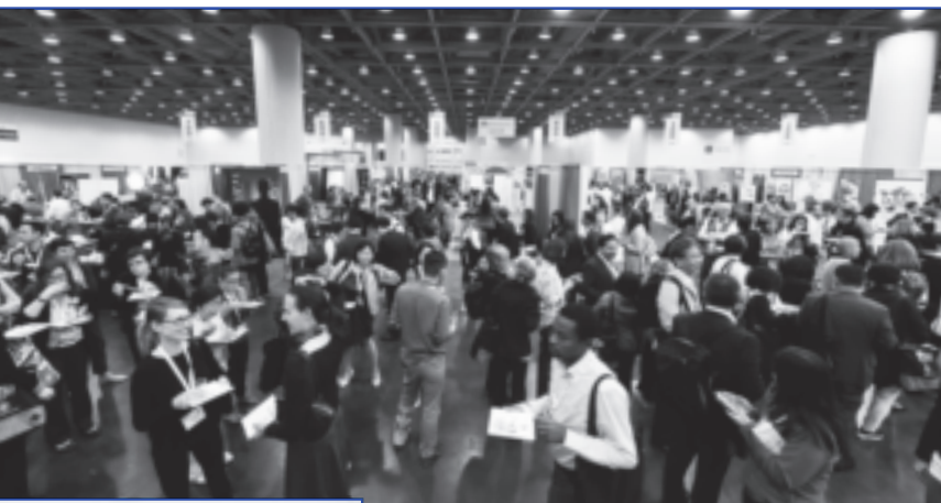
◆ The Exhibit Hall hosted booths from approximately 100 organizations, and also served as the venue for the meeting's many poster sessions.